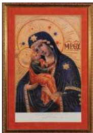
1988-89 Our Lady of Pochaiv