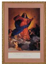
1990-91 Our Lady of the Assumption