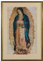
1979-80 Our Lady of Guadalupe