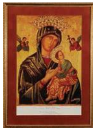
1984-85 Our Lady of Perpetual Help