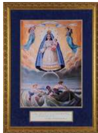
2007-08 Our Lady of Charity