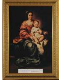
2002-03 Our Lady of the Rosary