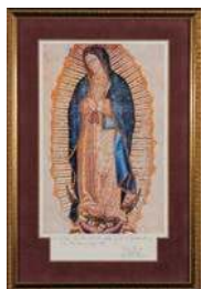
1995-96 Our Lady of Guadalupe