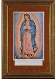
2000-01 Our Lady of Guadalupe