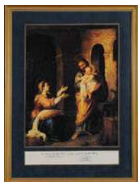
1993-94 Holy Family