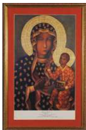
1986-87 Our Lady of Czestochowa