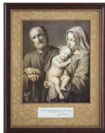
2015-16 Holy Family