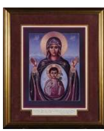
1997-98 Our Lady of the New Advent