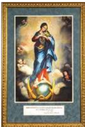
2013-14 Immaculate Conception