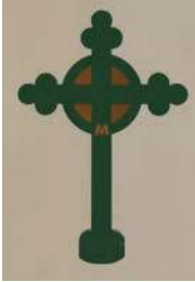
1999-2000 Millennium Cross