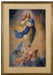
1981-82 Immaculate Conception