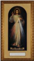
2003-04 Divine Mercy