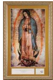
2011-13 Our Lady of Guadalupe